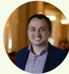
H.E. Mykola Solsyki