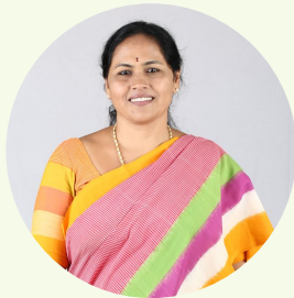
H.E Shobha Karandlaje